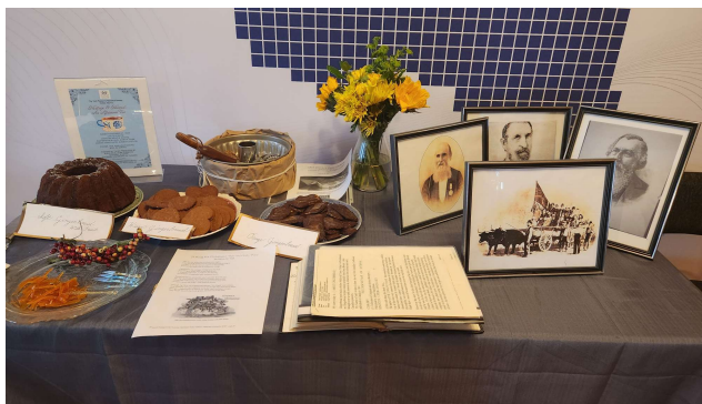
Above: A blend of heritage, history, and irresistible treats from November's event.