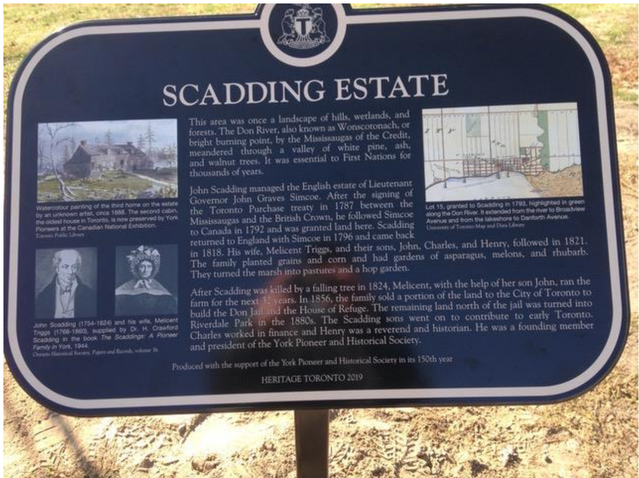
Above: The Scadding Estate Plaque.

In what has been a very difficult year, this has certainly proven to be a rare good news story for 2020. Thank you to all!