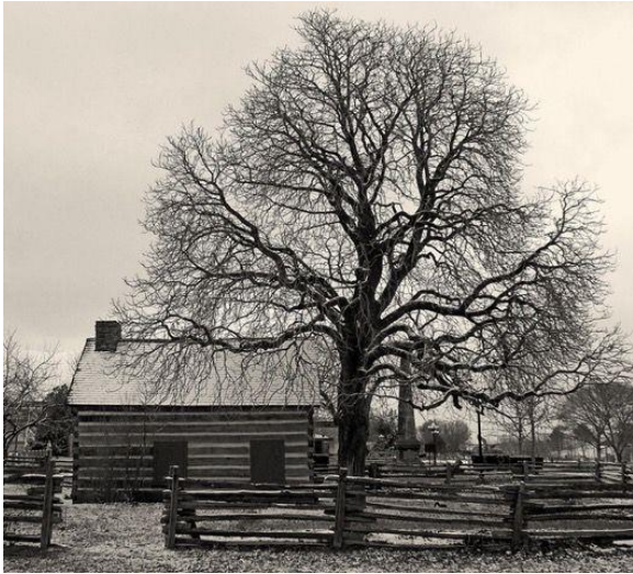
Above: Scadding Cabin in light snow, October 2020.