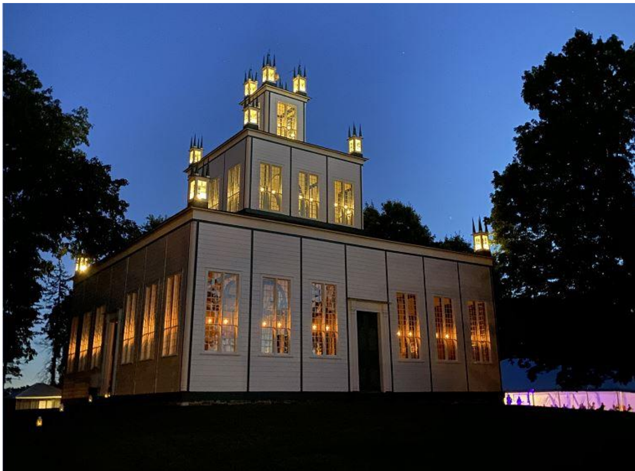
Above: The Sharon Temple Illumination.

This was the largest public event attended by York Pioneers in 2020 and the most in attendance at the Illumination in the past few years.