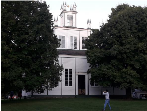
Above: The Sharon Temple.

The annual celebration of the Sharon Temple Illumination was held on September 11. This was a challenge this year due to the covid-19 restrictions and safety protocols. The Temple staff did a wonderful job to navigate and coordinate the special set up needed. The thought was not to miss the event. During the Spanish Flu 1918-1920, the Illumination continued in the manner in which the York Pioneer organized picnics and gatherings at this historic site. So the Temple made a decision to do likewise and carry on.