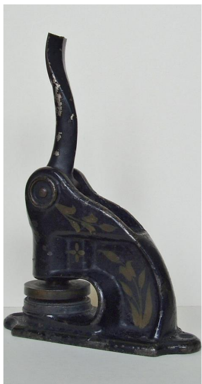
The YPHS corporate seal.

The seal is officially used on legal documents, such as those required when Sharon Temple was transferred to the Sharon Temple Museum Society. Unofficially, it provides a nice finishing touch to awards and life membership certificates.