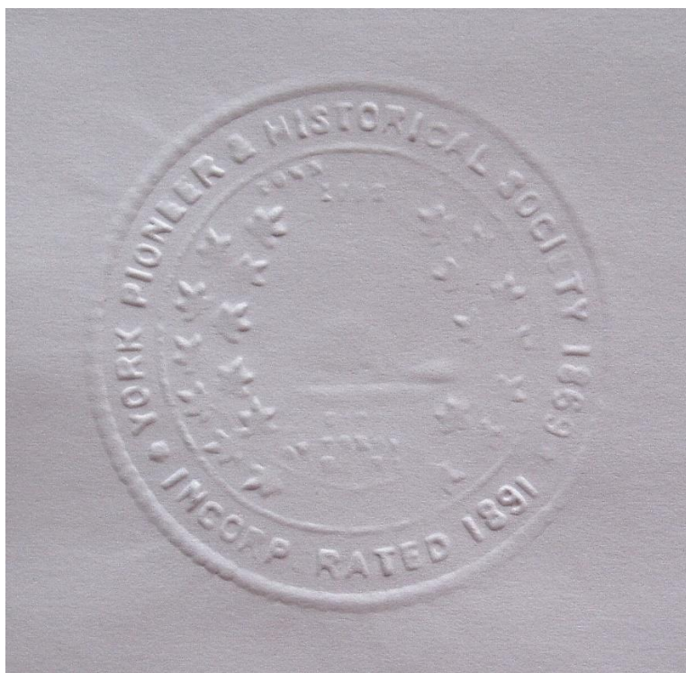
An imprint of the YPHS corporate seal. After 125 years of use, the beaver in the centre are barely visible.