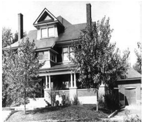
Above: John McKenzie House, home of the Ontario Historical Society, circa 1919.