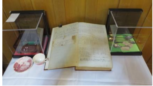
Above: The latest donations to the YPHS: the Scadding family tea caddy set, family Bible, and silver spoons.