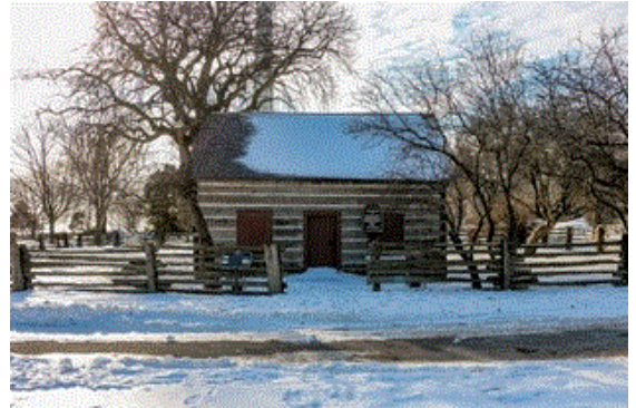
Above: Wintery scene at the Scadding Cabin