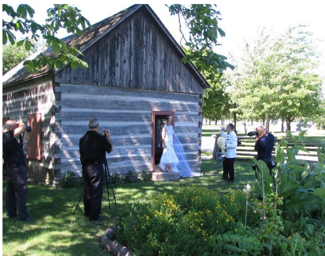
A wedding party uses the Cabin as a rustic background for photographs during National Historic Sites Day.