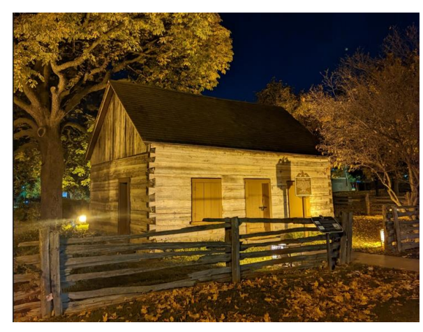
Above: Forbidding Scadding Cabin, Ghost Walk, October 2022.

Light refreshments will be available at the meeting.