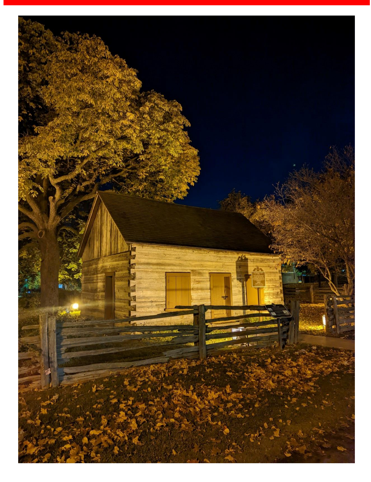
BEST WISHES IN 2023 FROM THE YORK PIONEER & HISTORICAL SOCIETY!!!